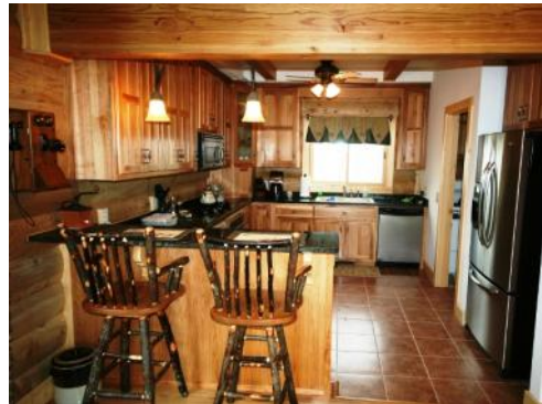
A few photos from North Carolina