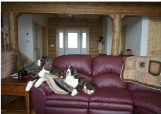
Two Happy "Dog Home owners"