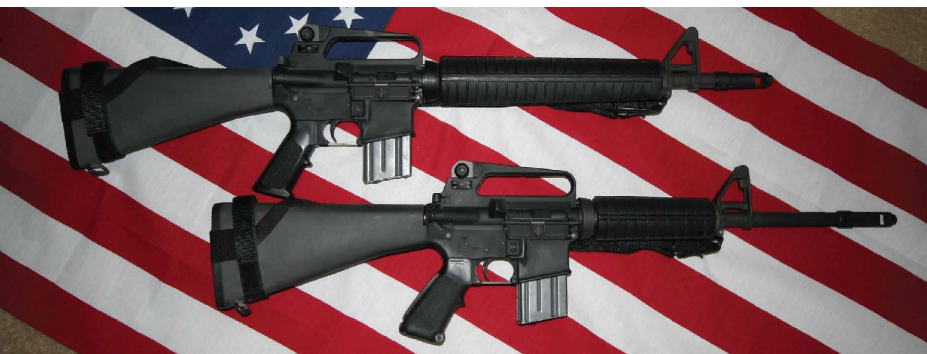
Bushmaster AR-15 (models vary)

This is our first time to offer a "non-log, non-lumber" bonus when you purchase one of our log home packages.