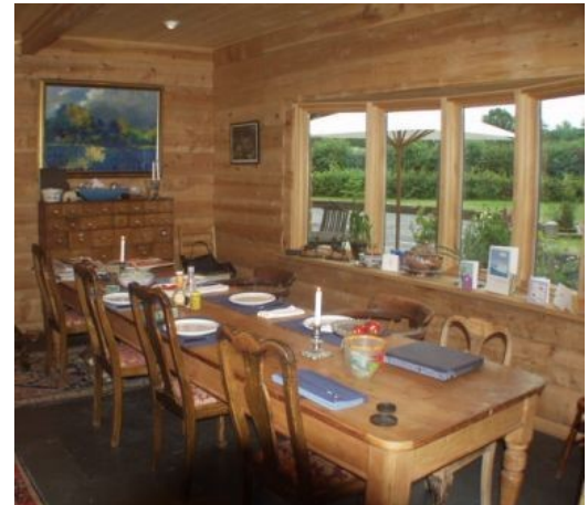
A great place to sit and plan

And if you want, we'll sit down with you and help plan "your home, your way". (Just make sure you have plenty of Dr. Pepper or iced tea.)